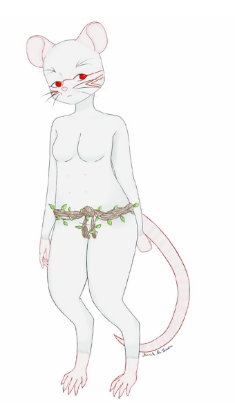
Figure 1 – A rat with a knot in its belly with the objective of validating the traditional knowledge of the Krahô Indians by academic science.

be determined considering the fieldwork data. It is not an easy task! Finally, what may the expected biological effect be in laboratory tests? Nootropic? Antipsychotic? Soothing? Stimulant?